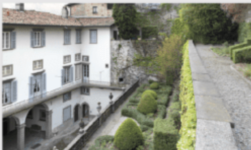
Gardens of 16th-century Palazzo Moroni, Bergamo

May with some extra safety measures in place. We used a booking system to limit visitor numbers, modified visitor routes and entrances and moved guidebooks, podcasts and videos online so they