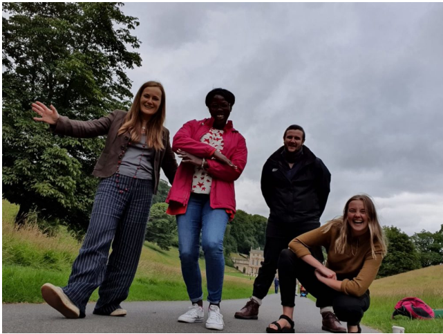
The INTO Secretariat team got together for a socially-distanced visit to Dyrham Park

Regional events: We had plans for actual meetings of INTO Asia, INTO Americas and INTO Europe this year, following the successful INTO Africa gathering . Plans for virtualising the first two are well underway.