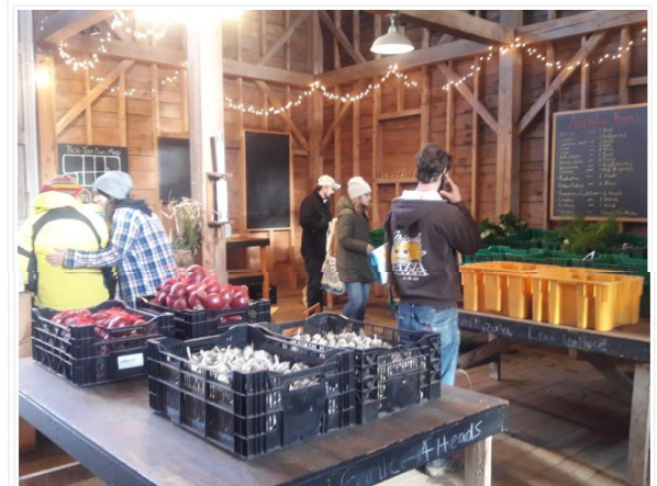
Local people collecting their CSA shares (Community Supported Agriculture) at the Trustees of Reservations' Appleton Farms, Massachusetts

The International National Trusts Organisation (INTO) is a non-profit organisation registered as a charity England and Wales (No 1175994). The Secretariat is based at our registered address, 20 Grosvenor Gardens, London SW1W 0DH, UK.