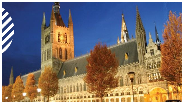
Cloth halls , Ypres

There are quite a few cloth halls in Flanders: buildings that were built in the middle Ages as a warehouse and covered market. The locally manufactured cloth was also checked and inspected there. This often resulted in a cross-border trade, where cloth from Flanders was sold in many places in Europe and even in Asia.