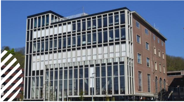
De Hoorn Brewery , Leuven

Heritage can also become 'European' as it enters the picture at a European level, for example as the winner of a prize, as a typical example of a successful restoration or as a best practice case of repurposing.