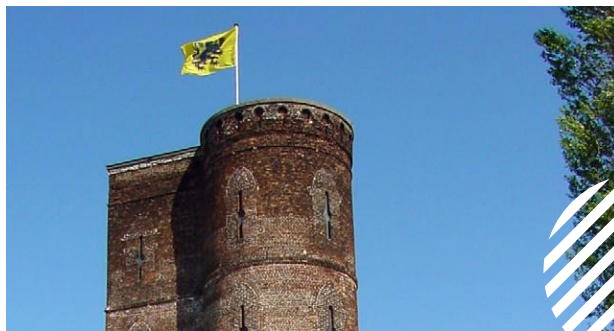
Graven tower , Rupelmonde (Kruibeke)

Since the 18th century - and certainly from the 19th century on - people have been experiencing special feelings at ruins. This 'special feeling' meant the introduction of 'romance' in Europe. At one hand, ruins are examples of failed monumental preservation that can be considered as serious warnings. On the other, they remind people of the quickly passing time, of the short duration of a human life. Nature, however, begins its new cycle every year. And will eventually take back what once has been built by people... In the Romantic 19th century; fake ruins were even built to cultivate these feelings. How are we going to deal with these ruins from 2018 onwards? Are there any examples of instances of rezoning? Can this be aided by European inspiration?