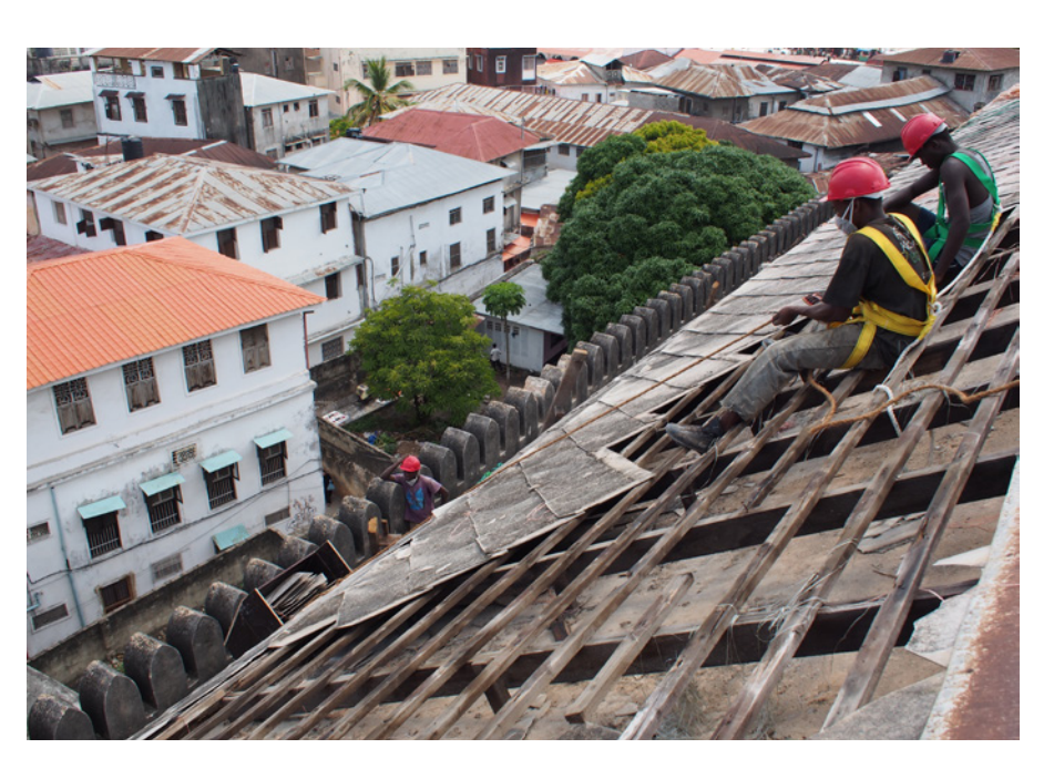
Image: WMFBritain was awarded an EU grant to conserve Zanzibar cathedral and create a heritage centre commemorating the abolition of slavery