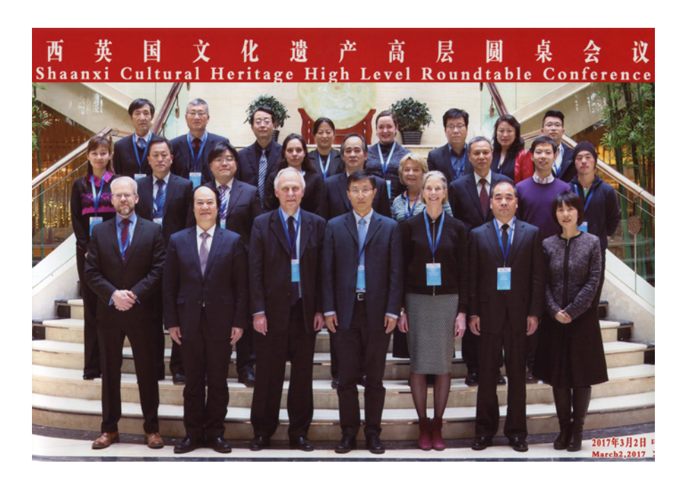
Image: Heritage ngo's took part in a high level cultural exchange to China (Icon)

There is also a wider context to consider. The success of the voluntary heritage sector's work at home impacts on the UK's international reputation. Our heritage is integral to the nation's identity so, with tourism one of the largest and most successful industries in the UK, the heritage sector should take credit for what Britain can offer international visitors at every level of interest from the big heritage honeypots to the warp and weft of our cities, towns and villages and countryside. Their appeal and interpretation owes much to the heroic efforts of national and local heritage bodies. A strong cultural identity is a catalyst for investment, for footloose businesses as well as for attracting visitors and students. In this digital age, UK heritage underpins the success of British film, television and video industries and enhances their export potential.