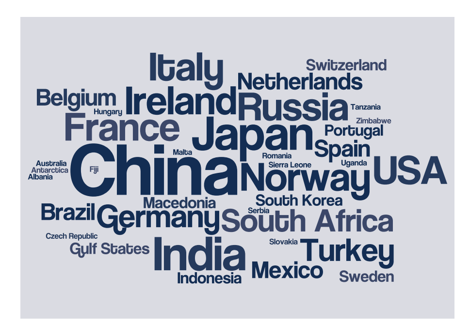
Image: International heritage activity weighted by Alliance members' engagement 2017