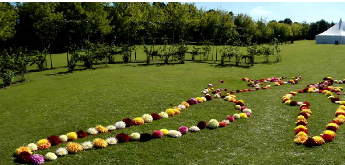
World in Flowers at the 2015 ICNT, Anglesey Abbey

All INTO Amici receive INTO publications, both written and electronic, including our newsletter which contains updates on some of the many projects that benefit from your donations. There are also views and stories from the Trusts around the world that bring our work to life.