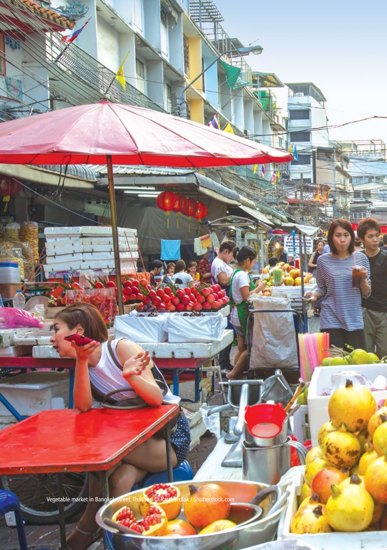
Vegetable market in Bangkok street, Thailand