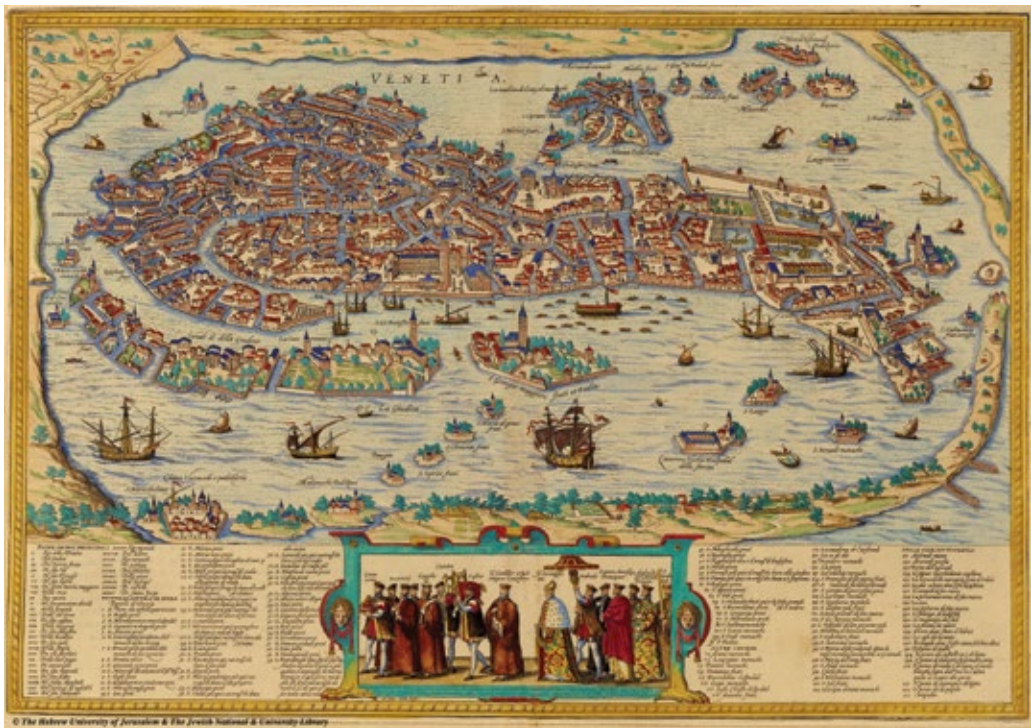
Venice in Braun and Hogenberg Civitates Orbis Terrarum (Atlas of Cities of the World)

Venice is a shrinking city. It has been losing population steadily over the last 50 years or so. This phenomenon is due to a combination