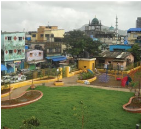
Renovated Lotus Garden, Mumbai, India

The space is now completed and there is such pressure from the community living around the space that they have had to limit the number of people using it at one time. The garden upgrading has included levelling, construction of a walkway, flower beds and seating. Play equipment for children and fitness equipment for adults have also been installed, as well as a water tank with the necessary plumbing and water pump. Painting of all the equipment as well as the fencing of the garden has been completed. There was also a demand for high mast in the garden and hiring of security guards by the residents to ensure that the space was adequately lighted and safe and thus accessible to all.