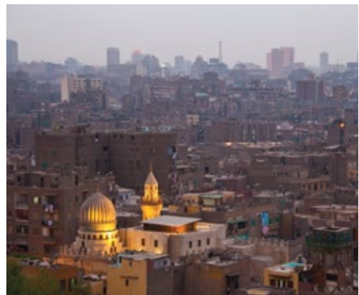
Darb al-Ahmar, Cairo, Egypt

An extensive survey conducted in Darb al-Ahmar revealed that the district suffered from a series of weaknesses commonly found throughout Cairo, including low family incomes and an economic base that often lagged behind development in newer parts of the city; a deteriorating housing situation resulting from unrealistic planning constraints and pending demolition orders; limited access to credit and widespread insecurity of tenure, continued deterioration of monuments and historic structures, lack of public investment and regular upkeep of city infrastructure and the absence of essential community facilities and services. The district, however, also presented a number of strengths such as a highly-cohesive urban environment, an established community, a dense residential core with people helping and depending on one another, an important pool