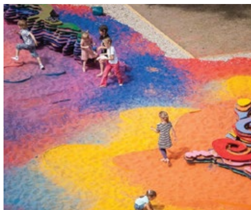
"Practice of freedom II" Children enjoying the colourful sand © Adam Kalinowski

In the Morro da Providência slum in Rio de Janeiro, the artist paid tribute to those who play an essential role in society but are the primary victims of war, crime, rape and political or religious fanaticism, pasting miscellaneous photos of ten women onto the sides of houses and public stairways along a steep slope, positioned to look toward the city centre. A number of them are relatives of three young men who were killed in the favela , caught in the turf wars between corrupt military police and drug traffickers. The photographs reveal not grief or despair but identity and humanity. Such intimate portraits pasted in these urban landscapes allow passersby to encounter these women as large, central figures in their communities.