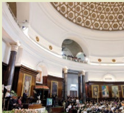
Parliament of India

It has been argued that the highest expression of democratic life – parliaments and city council chambers - should also be considered as public spaces not solely because their sessions are open to the public without any charge, but because of their high civic significance as the public spaces of democracy. In this sense, parliaments and all open arenas of political debate, however defined in different cultures, should be considered both highly symbolic and tangible examples of "public space".