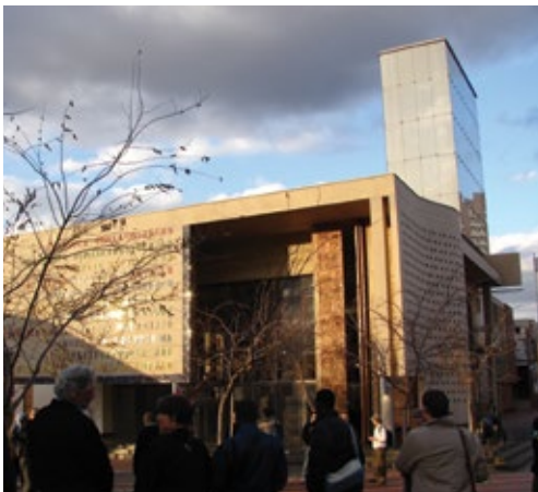
Constitution Court, Johannesburg, South Africa

Some of the old buildings were preserved and converted into a system of museums. New buildings such as the Constitutional Court