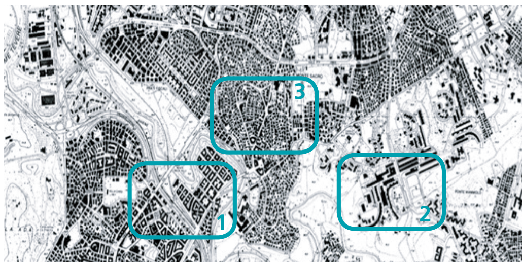
Map 1: Rome

Furthermore, public space can lead implementation and urban development when its development is linked to that of buildings and facilities. In many contexts, building will be permitted only if public space has been developed and organized. This link between public space and urban development is critical and needs to be understood in each context and legal framework in order to prevent the creation of unmanaged and unimproved open spaces and/or public space deficiencies common to many cities.