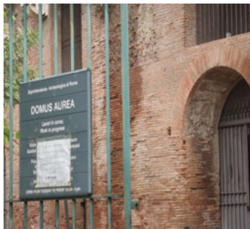
Restoration of Domus Aurea, Rome, Italy

Up to now, Nero's Domus Aurea has been an invisible public monument. The Domus Aurea's long story starts in 63 AD, when Emperor Nero seized a huge tract of public land around where the Colosseum now stands to build a sumptuous imperial palace, the Domus Aurea (the "Golden Palace"). His successors, anxious to build political capital on Nero's unpopularity, decided to give the land back to the Romans by building public baths (Titus and Trajan), and a huge amphitheatre (Vespasian). In a gesture of supreme scorn, Trajan decided to use Nero's Domus Aurea as a foundation for his new grand public baths. From there on, the Domus disappeared from public view; only many centuries later, did Raphael and other Renaissance painters rediscover it by penetrating