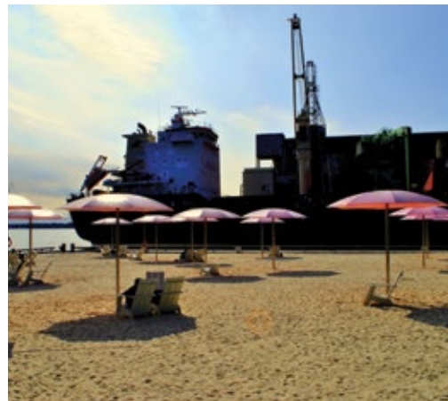
5. View of Sugar Beach, Toronto, Canada

Canada's Sugar Beach is a whimsical new park that transformed a surface parking lot in a former industrial area into Toronto's second urban beach. Located at the foot of Lower Jarvis Street adjacent to the Redpath Sugar Factory, the 8,500 square metre (2-acre) park is the first public space visitors see as they travel along Queens Quay from the central waterfront. The park's brightly-coloured pink beach umbrellas and iconic candy-striped rock outcroppings