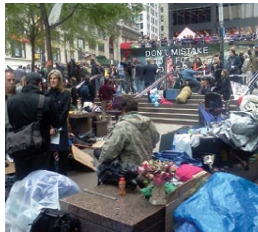
Zuccotti Park occupancy, New York, USA

The square was created in exchange for additional buildable surface granted to the original developers. In 2011, the civil movement Occupy Wall Street began its protest against the global financial system and chose to occupy the park, camping there for several weeks. After