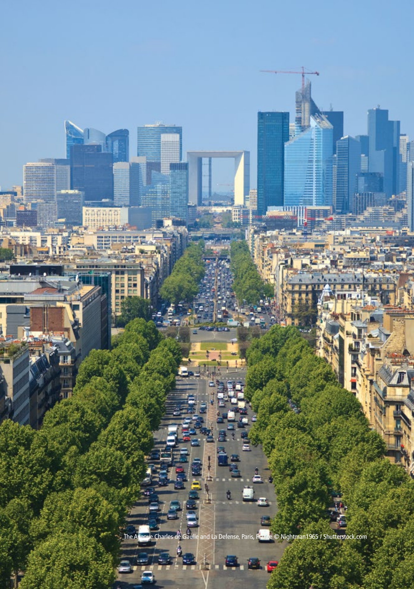
The Avenue Charles de Gaulle and La Defense, Paris, France