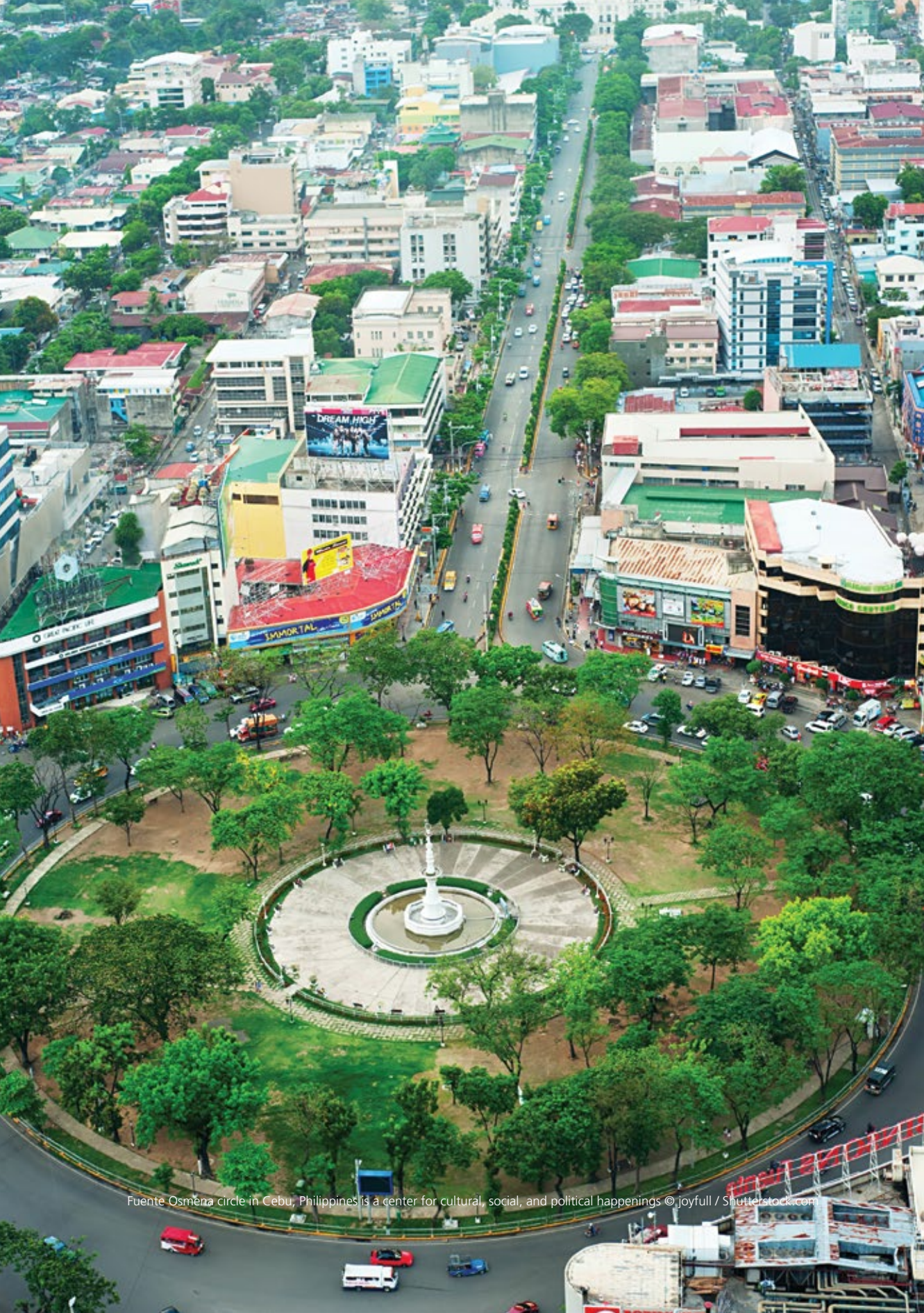
Fuente Osmeña circle in Cebu, Philippines is a center for cultural, social, and political happenings