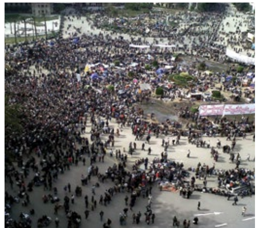
Tahrir Square, Cairo, Egypt

During the early part of the 20th century, the modern downtown Cairo emerged in this square region which was, at that time, called Ismailia Square in Ismailia District. The Square had to be replanned to facilitate the newly-introduced vehicular traffic in Cairo, brought by the British. The roundabout in the southern part of the square was consequently built and the Square witnessed its first serious demonstrations during the same era. Opposition to the British presence in Egypt sparked protests and skirmishes, with police killing two lots of Egyptians in 1946. Dissatisfaction with King Farouk's government brought about another set of protests that resulted in the Great Fire of Cairo in 1952, when many buildings around the square were casualties of the blaze. The