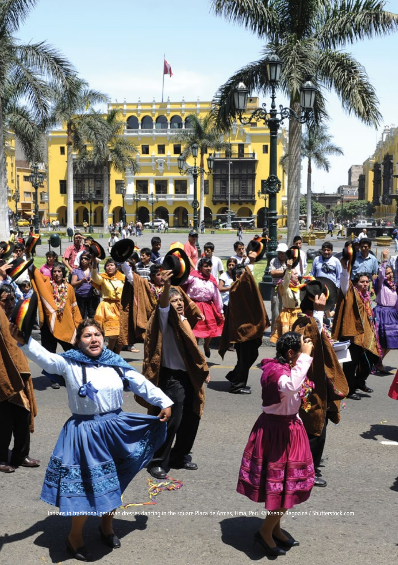
Indians in traditional peruvian dresses dancing in the square Plaza de Armas, Lima, Peru