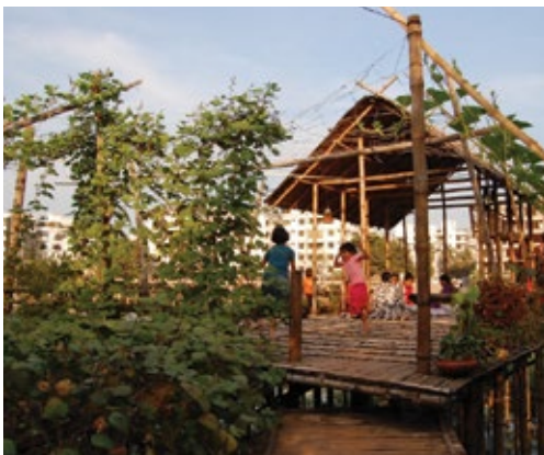
Platform of hope, Dhaka, Bangladesh

Designed for children living in the settlement, it is a clean, new space in which they can play, sing, dance, interact and read books from a small library. In the evening, families gather for relaxation and enjoy the view over the water. The Platform of Hope stands in stark contrast to the constant threat of eviction with which the Korail residents live, without security of tenure, on land that is becoming ever more valuable in the densest city in the world. Yet local residents have the skills and willingness to change their