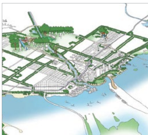
A sketch of the future park system

Miami's Vision for the 21st century envisages "a connected system of new and renewed parks and public spaces to meet the needs of its diverse citizenry, with more ways to experience