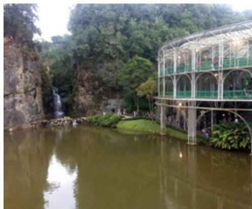
Opera de Arame, Curitiba, Brazil

Odyssey it was but decades later the Opera de Arame still stands and is the venue for a variety of cultural events. An abandoned quarry became a permanent and remarkable public space on the strength of urgency, which can often lead to timeless works, and became a landmark of what was to become one of Curitiba’s landmarks - recycling.