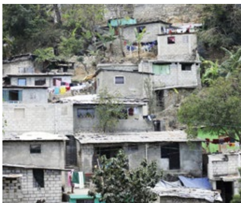
Slum in Port-au-Prince, Haiti

One of UN-Habitat's post-earthquake tasks in Haiti was a Participatory Planning Project (URBANISMEPARTICIPATIF) in the informal settlement of Carrefourfeuilles on a hill overlooking the Old Town. One of the thrusts of the project was to create conditions favourable to community life through public spaces and social and cultural facilities. The protection and development of public spaces, so rare in informal settlements, is a priority - particularly