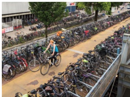
Multiple level bicycle parking, Amsterdam, Netherlands