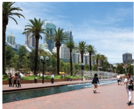
Darling Harbour walkway, Sydney, Australia

One of the initiatives funded by the Australian Youth Foundation is the Girls in Space Programme, which is being undertaken by a consortium composed of Contact Youth Theatre, Backbone Youth Arts, Digitarts Young Women on-line, The Brisbane City Council and Queensland and Northern Territory Multimedia Youth Works.