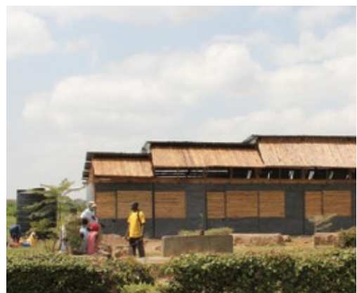
Kibera Public Space Project, Nairobi, Kenya

Through an intensely-collaborative process facilitated by the Kounkuey Design Initiative, residents first identify their needs and typically cite water and sanitation infrastructure and income generation as their greatest priorities. Next, the Kounkuey Design Initiative, residents design a physical space and programming to meet their expressed needs, raise a portion of the required funding and build and organize the management of the Productive Public Space.