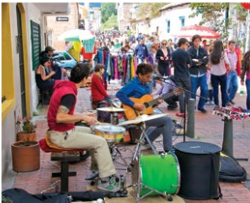
A street in Bogota Colombia

In Colombia, the Contribucion por Valorizacion (a form of betterment levy) is a mechanism to finance public infrastructure and public spaces. It is not a tax but a contribution that has a specific objective: raise funds to build a public space or street or other kind of infrastructure by charging property owners whose assets will increase in value as a result of public investment. The contribution is calculated as a proportion of the assessed increase in value to the increase of land value and can be