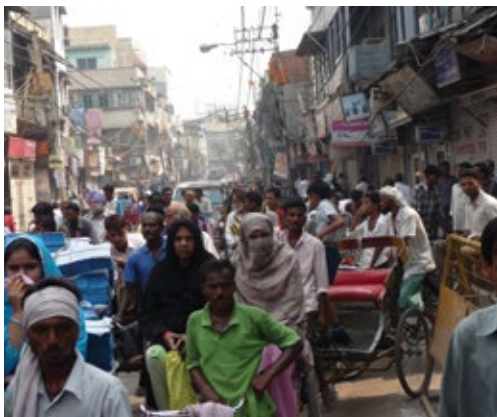
A busy street in New Delhi, India

Safety audits were conducted in five municipal areas of Delhi, as part of the 'Safer Cities Free of Violence against Women and Girls Initiative' by UN Women in partnership with UN-Habitat,