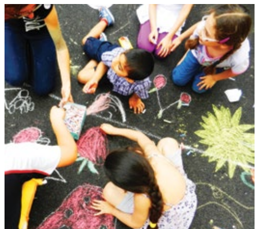
Children in Sassari participate in recreating public space

The project received first prize at the 2013 Biennial of European Towns and Town Planners.