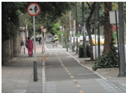
Dedicated bicycle lanes in Bogota, Colombia © Flickr/adrimcm

Source: Jan Gehl, Cities for People , Island Press, Washington / Covelo/London