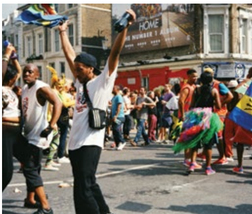
Notting Hill Carnival, London, UK

The Notting Hill Carnival is the largest street festival in Europe. It originated in 1964 as a way for Afro-Caribbean communities to celebrate their own cultures and traditions. Taking place every August Bank Holiday weekend in the streets of London W11, the Notting Hill Carnival is an amazing array of sounds, colourful sights and social solidarity.