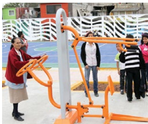
A public space renovated by Programa de Rescate de Espacios Públicos

In Mexico, the Mexican Ministry of Social Development, has ‘rescued’ 42,000 public spaces across the country in the past five years. Rescue of Public Spaces is a programme that promotes the realization of social actions and the execution of physical works to restore community meeting places, social interaction and everyday recreation in insecure and marginalized neighbourhoods. The goals are to help improve the quality of life and safety through the revitalization of public spaces in cities and metropolitan areas, thereby promoting healthy living. Furthermore, the initiative is intended to link urban development to social development; promote community organization and participation; increase community safety and prevent antisocial activity and help strengthen the sense of community