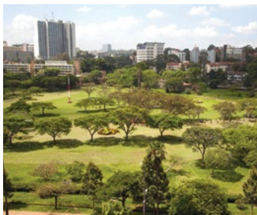
View of Uhuru Park, Nairobi, Kenya

One of the most famous examples of the power of peaceful protest against public space abuse was the opposition that Professor Wangari Maathai, later to be awarded a Nobel Peace Prize.