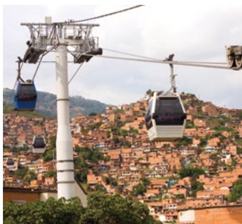
The metrocable in Medellin, Colombia

Running 20 hours a day, elevated cable cars link remote informal settlements to the central metro system. What could take up to two hours on a crowded minibus now only takes seven minutes. Integral Urban Projects ( Proyectos Urbanos Integrales or PUI) focused the city's resources on specific locations characterized by poverty and social unrest with a grand vision of providing the best public buildings and transportation system for the poorest parts of the city.