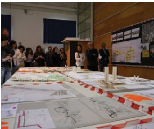
Discussions during the 2011 Biennial of Public Space

Interdisciplinary and participatory approaches can be greatly facilitated by regular events where different issues, different disciplines, and different actors can maintain a permanent dialogue on the creation, management and enjoyment of public space. One such event is the Biennial of Public Space, a gathering held in Rome every two years in the former municipal abattoir now converted into a vast public space, and hosted by the Faculty of Architecture of Rome's Third University.