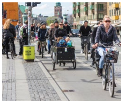
Cycling is a way of life in Copenhagen, Denmark

As conditions for bicyclists improve, a new culture is emerging. Children and seniors, business people and students, parents with young children, mayors and royalty all ride bicycles. Bicycling in the city has become the way to get around. It is faster and cheaper than other transport options and also good for the environment and personal health. The city has promoted its cycling system for many years, and now bicycles are the most used transport to go to and from work and educational institutions; the plan is to keep promoting and getting more citizens to adapt to the system and make the most of its benefits.