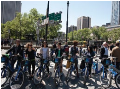
Bike sharing in New York, USA

In terms of the area they cover, streets, squares and sidewalks constitute the overwhelming portion of the urban space used by the public. It is therefore important for their use to be disciplined to reconcile the different functions they are to perform, granting priority to pedestrian and non-motorized mobility.