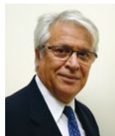
Dr. Joan Clos

Public spaces contribute to defining the cultural, social, economic and political functions of cities. They continue to be the first element to mark the status of a place from a chaotic and unplanned settlement to a well-established town or city.