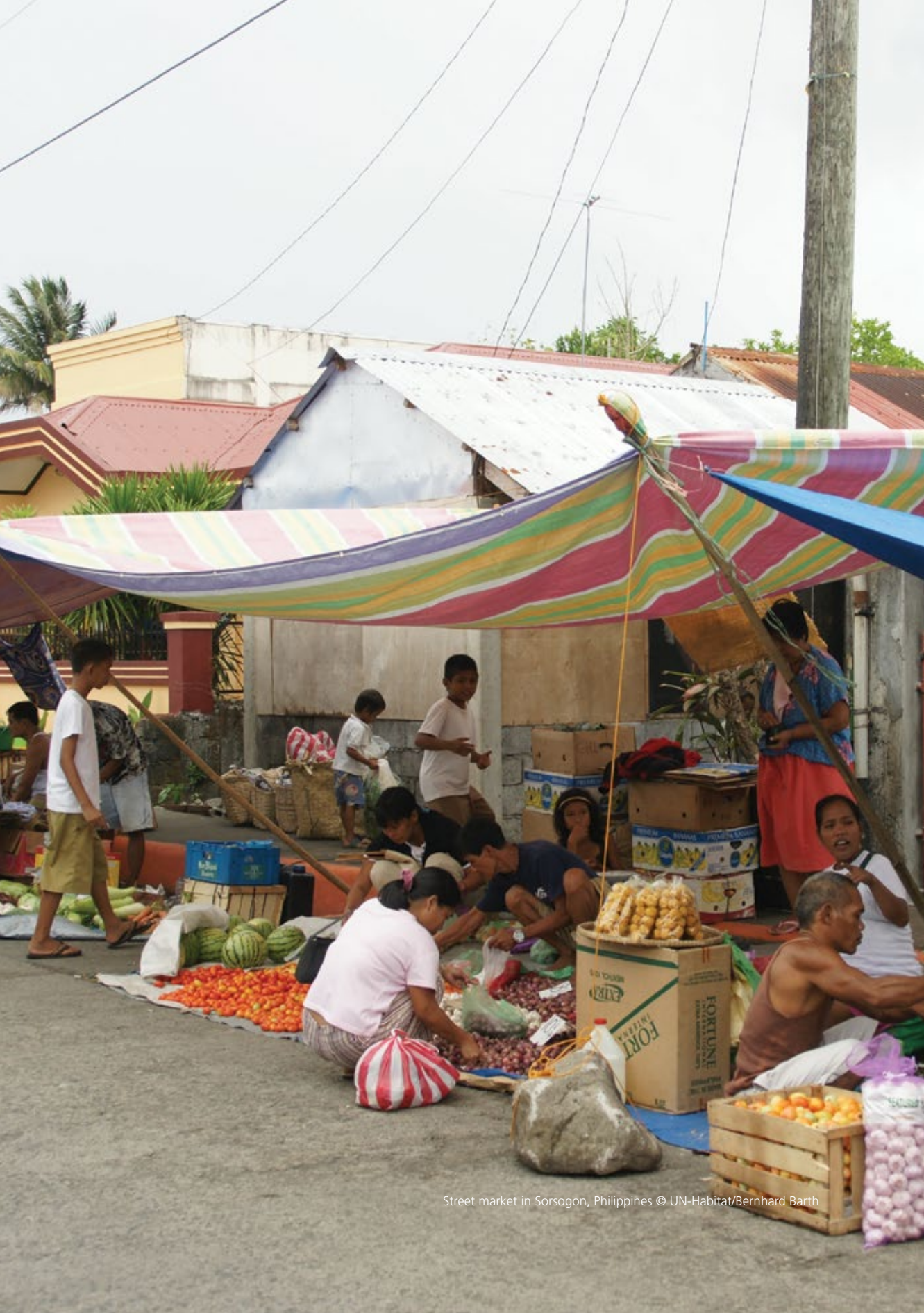
Street market in Sorsogon, Philippines