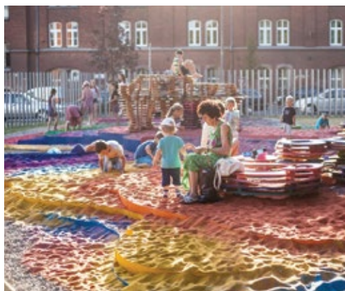
Parents and children playing in the sand