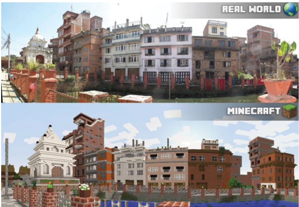
Minecraft design of a new public space. Kirtipur, Kathmandu, Nepal.

Kirtipur is an old settlement in Kathmandu Valley which has maintained its traditional life style and culture. Like other urban settlements in the Kathmandu Valley, Kirtipur developed excellent systems for water and urban space management. Public water bodies such as ponds, stone spouts and wells are surrounded