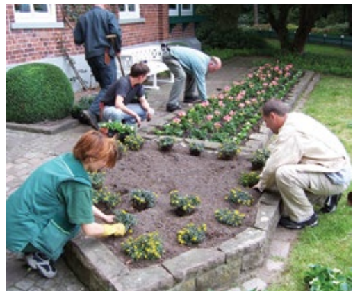
Residents tend to Bremen's Citizen Park, Bremen, Germany

The motto of the Bremen Citizens' Park founders in 1865 was 'for masters and employed, for men, women and children, to use and enjoy forever'. Extending 37 hectares in the centre of metropolitan Bremen, the Citizens' Park is one of the few completely-preserved park designs of the 19th century and one the most important landscape parks in Europe. The architect William Benque, influenced by American city parks, designed it in 1865. Since its creation in 1866, the Bremen Citizens' Park has been almost entirely privately financed.