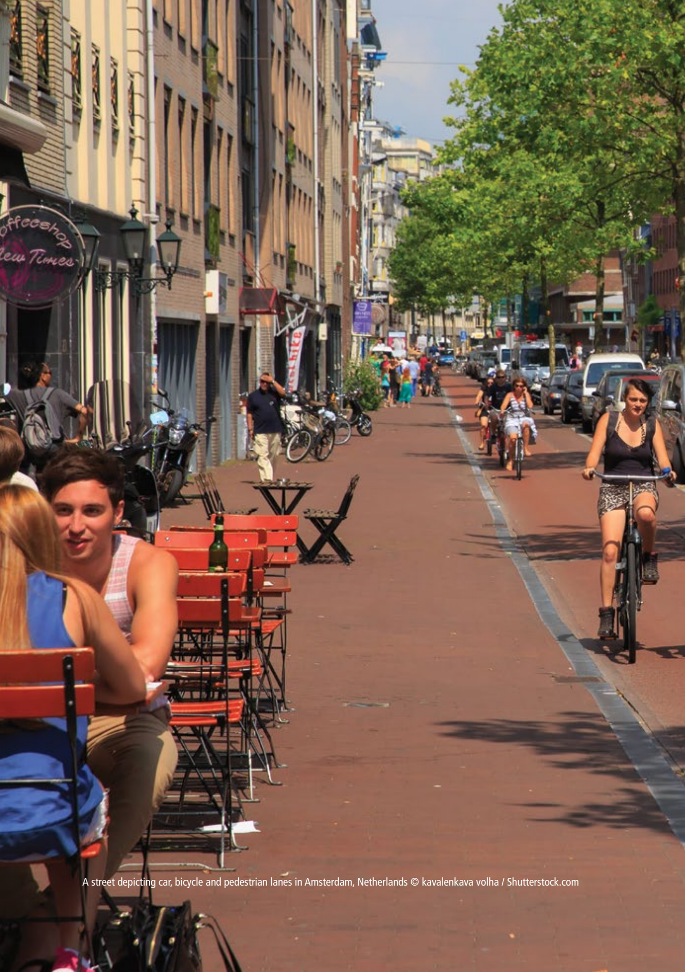
A street depicting car, bicycle and pedestrian lanes in Amsterdam, Netherlands