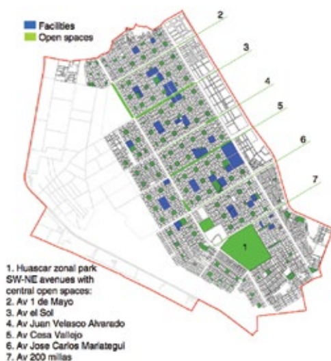
Plan of Villa el Salvador, Lima, Peru © Ana Coello

Housing was meant to be incremental and self-built. Formal, constructive and hygienic aspects of housing were not regulated. Today, many of the lots are occupied fully, resulting in 100 per cent land coverage. with deficient hygienic conditions (light and ventilation) with, for example, 90 per cent of the kitchens having no chimneys (INEI 2007 census).