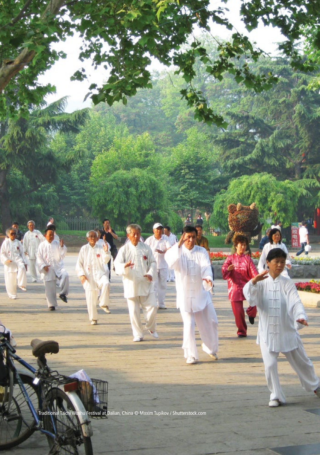
Traditional Taichi Wushu Festival at Dalian, China