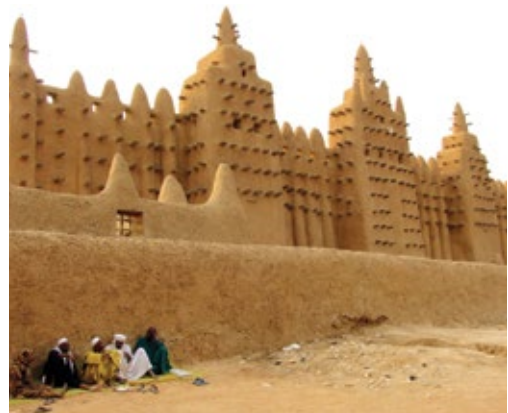
Great mosque of Djenné, Mali