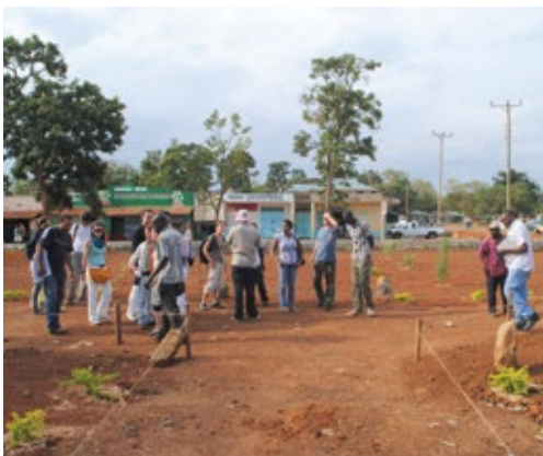
Marking out the new city park in Bondo, Kenya

The creation and upkeep of a small city park with the active collaboration of citizens can happen in a town not especially endowed with resources, simply on the strength of civic pride and a love for good public space.