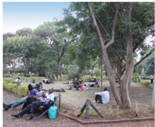
Residents relax at Jeevanjee Gardens, Nairobi, Kenya

In 2013, participatory design workshops were conducted with the City Council and communities for the upgrading and recitalisation of Jeevanjee Gardens. Over the years a number of illegal