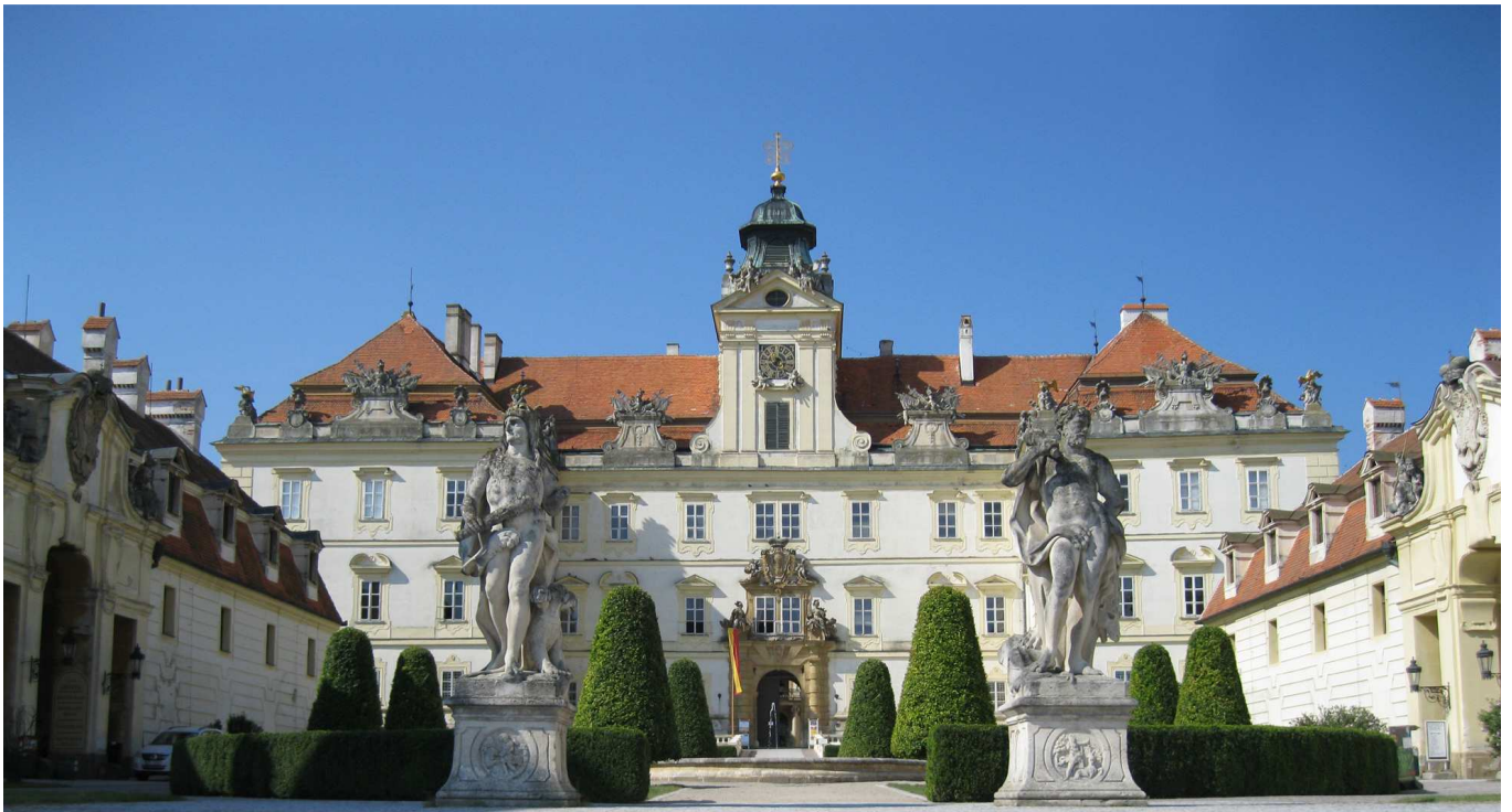
Valtice Chateau, one of the most impressive Baroque residences of Central Europe. It was designed as the seat of the Princes of Liechtenstein by Johann Bernhard Fischer von Erlach.

This small country has the largest concentration of great houses and palaces in Europe, built by Czech Renaissance magnates and the wealthy nobility of the Habsburg Empire, while the castles that are such a dramatic feature of the landscape reflect Bohemia's power and influence in the Middle Ages.