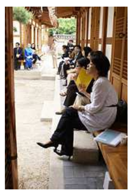
Delegates at the Conference for the Asian Partnership of National Trusts, Creative Asia, 23 May 2008 held in Seoul, Korea.

During the Executive Committee Meeting in Bratislava there were a number of opportunities for networking and awareness raising with the Slovak and European heritage communities. The visit culminated on 7 November, with a workshop entitled "The Co-operation of State and NGOs – The National Trust Models in the World," attended by representatives of Slovak and European heritage organisations and the European Commission.