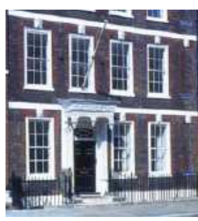
32 Queen Anne's Gate, London, headquarters of the International National Trusts Organisation.