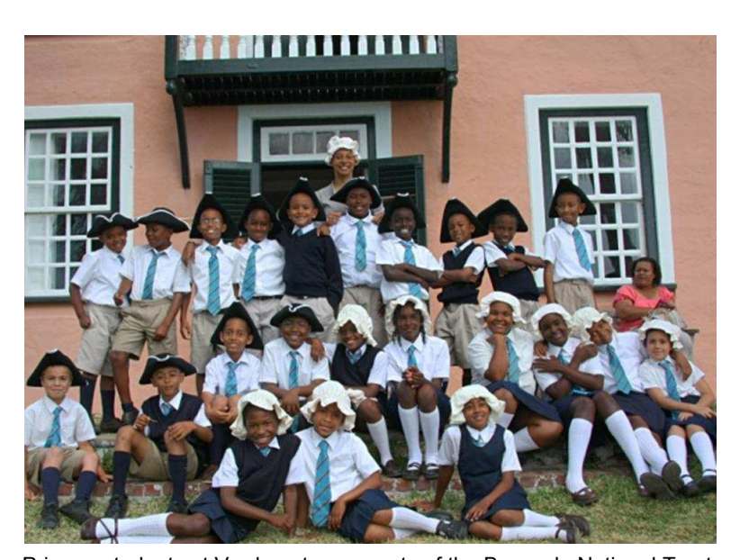
Primary students at Verdmont, a property of the Bermuda National Trust.