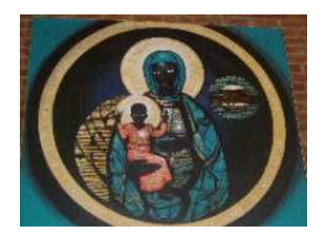
Photo Above: The Madonna and infant Jesus, Regina Mundi Church, South Africa.