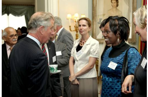
HRH The Prince of Wales meeting INTO members and reporters at Clarence House

The International Conference of National Trusts (ICNT) is an on-going membership service and it is always such a thrill when the members of INTO come together on a biennial basis to share best practice and to speak in one voice on matters of common concern. We are delighted that the next ICNT will be hosted by the Cross-Cultural Foundation of Uganda in Entebbe from 30 September to 4 October 2013.