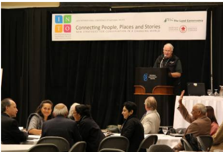
2011 INTO Congress, Victoria, Canada

The Trustees (who are also the Directors for the purposes of company law) are pleased to present their annual report together with the consolidated financial statements of the charity for the year ending 31 December 2011 which are also prepared to meet the requirements for a Directors' Report and Accounts for Companies Act purposes. The Trustees who served during the period are as follows: