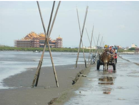
Dachen Wetlands, Taiwan

INTO lent its support to the Taiwan Environmental Information Association (TEIA) campaign opposing the construction of a petro-chemical factory on the unique Dachen Wetlands.