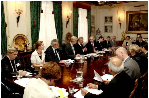
INTO members participating in a round table discussion at Clarence House, 22 June 2011