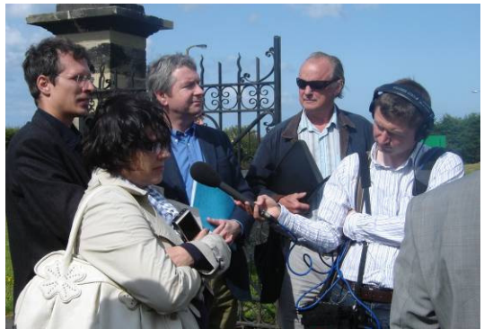
Interviewing CEP participants

In terms of awareness-raising, the major events for INTO in 2011 (our party at Clarence House in the presence of HRH The Prince of Wales, the INTO conference in Victoria and our presence in Durban) are discussed elsewhere in this report.