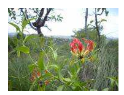
Green School flag ceremony, Ireland; Nature walk; School visit to Experiment Farm Cottage; Flame Lilies