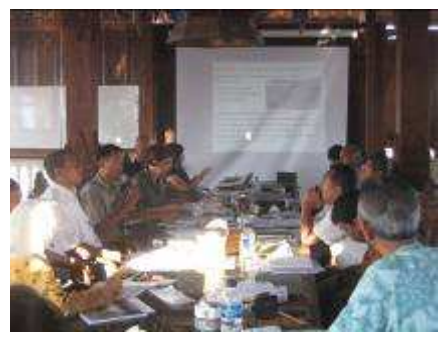
Heritage Cities training in Indonesia

In November, our Chairman attended a conference in Guangyang, China, devastated by an earthquake in 2008. The Ruan Yisan Heritage Foundation is seeking to develop capacity for heritage restoration and tourism as a way of rebuilding the communities along the Ancient Shu Road. Sharing experiences in this direct way is an important facet of INTO's work which we hope to continue and develop.