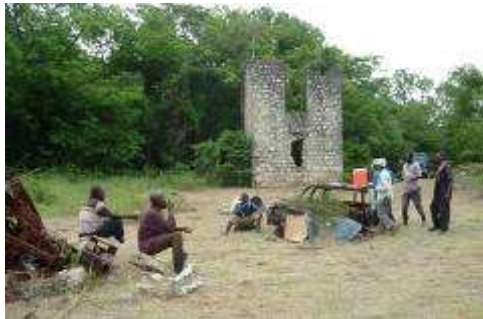
Volunteers at Stewart Castle, Jamaica National Heritage Trust

Prince Claus Fund. We hope to continue to be able to react and help save vanishing heritage in the future.