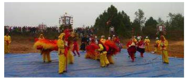
The Shu Road, China, November 2009