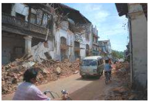
Batang Arau. Indonesia

On Wednesday September 30, 2009, an earthquake measuring 7.9 on the Richter scale rocked West Sumatra. Most of the casualties were in Padang (the capital of West Sumatra with a population of 750,000) and Pariaman. We were all saddened to follow the reports of lives lost and widespread destruction but were heartened by the resilience of the team at BPPI, the Indonesian Heritage Trust, who have been assessing the damage and developing priorities for rehabilitation. To help BPPI undertake their rapid assessment, INTO launched an appeal for funds which raised over US$1000 to be added to the 5000 EUR pledged by the Cultural Emergency Response Programme of the