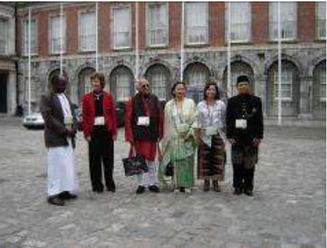
Delegates in Dublin, September 2009

INTO membership expansion, awareness raising and capacity building of embryonic groups (which will eventually lead to the establishment of new National Trusts) has proceeded apace. Three Regional Groups are in the process of formation; INTO Africa, INTO Asia and INTO Europe. Each is following a different organisational model and we look forward to seeing how they develop through the course of 2010. It is encouraging to note that the establishment of each Regional Group appears to be acting as a catalyst for new Trusts or similar heritage organisations to be founded.