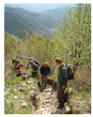
Les Trois Becs

Colleagues from the UK and Jersey recently worked together on a Strategic Review of the National Trust for Jersey. The next stage of the project is to draw up an outline 3 year business plan building on the chosen strategic approach.