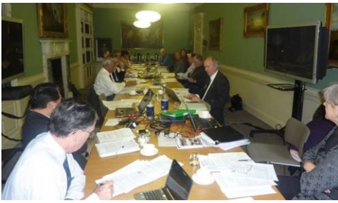
Executive Committee meeting in London