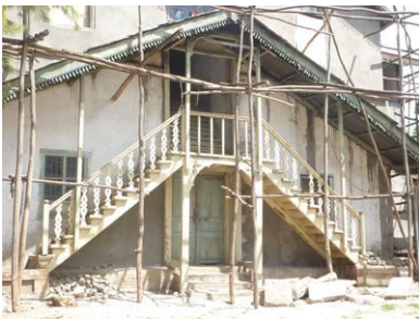
The Mohammedali House in Ethiopia, an inspirational Addis Woubet project