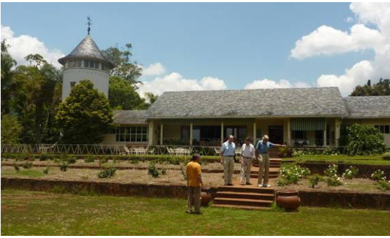
The Zimbabwe National Trust's La Rochelle

We are deeply thankful to our INTO Amicus members for their generous support of capacity building projects helping communities around the world in their endeavours to protect, preserve and promote their built, natural and cultural heritage.