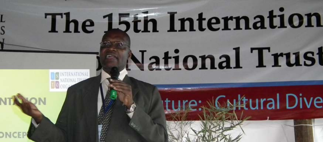
Moses Mapesa, IUCN WCPA Regional Vice Chair, addressing ICNT delegates

Unlocking potential was the third conference strand: What can we learn from the experience of National Trusts in protecting heritage in different contexts? What new experiences and ideas exist for financing, managing, and promoting heritage development?