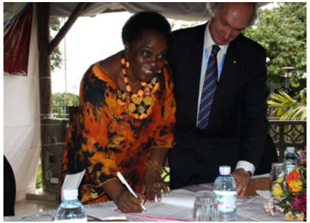
INTO Chair with Hon Maria Mutagamba, Ugandan Minister for Tourism, Wildlife & Antiquities

2013 marked a turning point in INTO's history as we convened the International Conference of National Trusts for the first time in the continent of Africa. It was my honour to lead the team drafting our 'Entebbe Declaration' which came out of the deliberations in Uganda, and which urged global action to protect and promote tangible and intangible heritage, especially within the least economically developed nations.