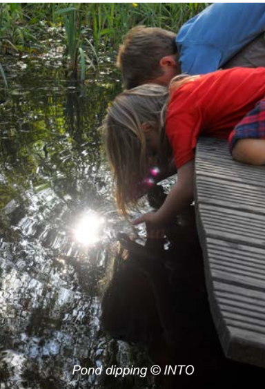
Pond dipping