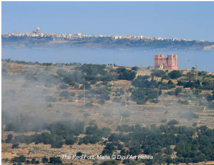
The Red Fort, Malta