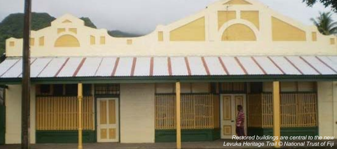
Restored buildings are central to the new Levuka Heritage Trail