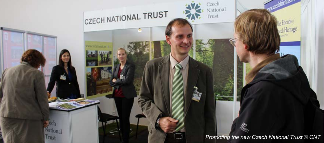
Promoting the new Czech National Trust