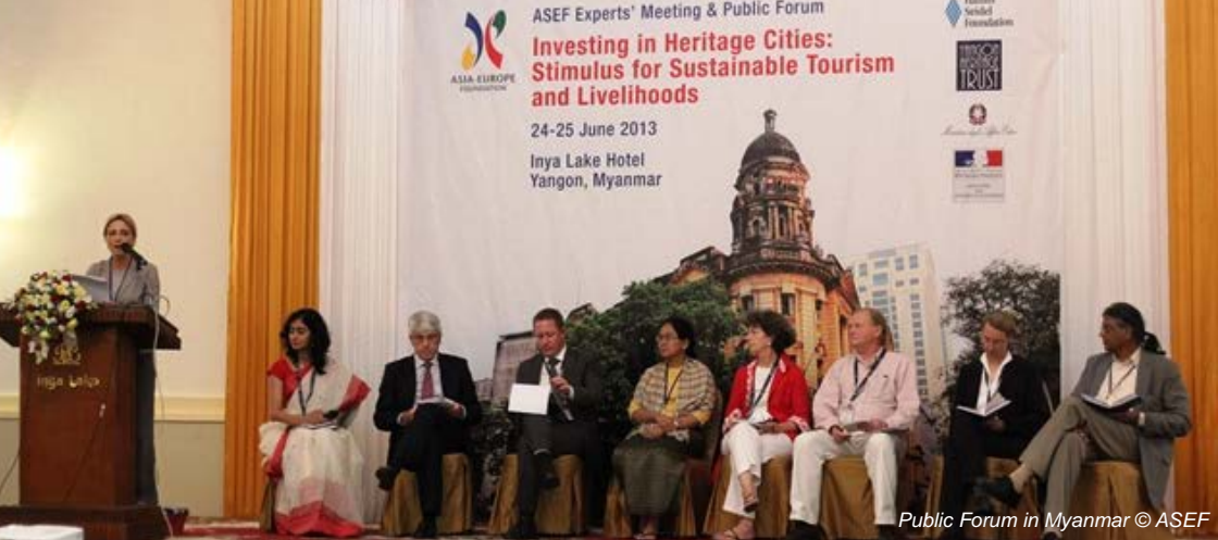
Public Forum in Myanmar