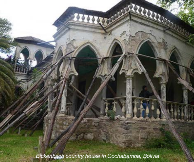
Bickenbach country house in Cochabamba, Bolivia

As part of the second thread of the conference, delegates discussed how to balance cultural values with conservation and the need for sustainable development. We heard from the Trust for African Rock Art (TARA), about successful efforts to engage local communities emotionally with rock art sites, finding alternative solutions to damaging practices and shared site management to deliver economic benefit through responsible tourism. The Kondoa rock art sites, located on the eastern slopes of the