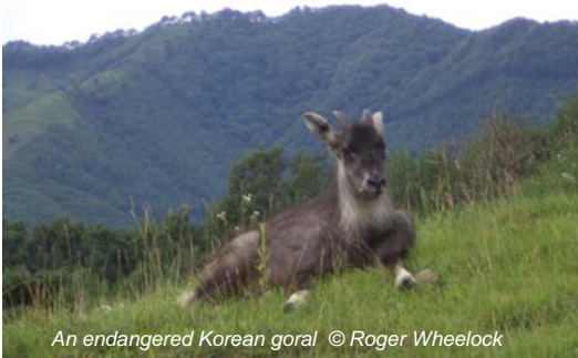
An endangered Korean goral