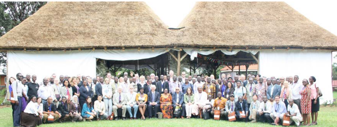
ICNT delegates in Uganda

12 years on from Edinburgh, we will also have the opportunity to consider the role of National Trusts in the 21st century while reaffirming the founding principles of INTO and measuring how far we have come. We look forward to seeing you there!