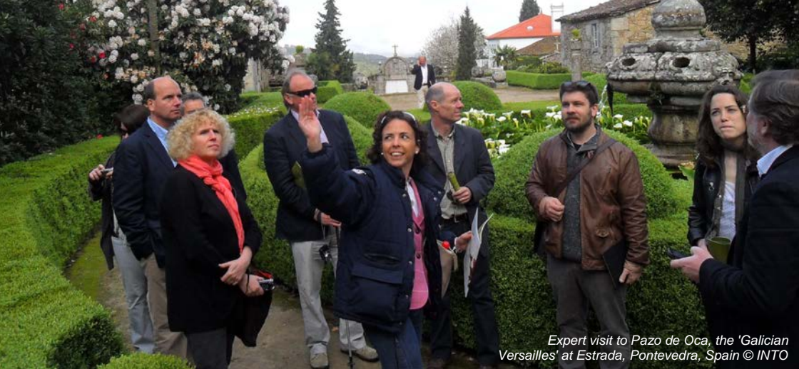
Expert visit to Pazo de Oca, the 'Galician Versailles' at Estrada, Pontevedra, Spain