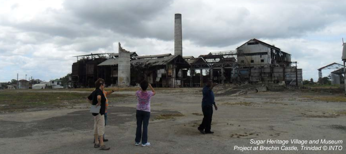
Sugar Heritage Village and Museum Project at Brechin Castle, Trinidad