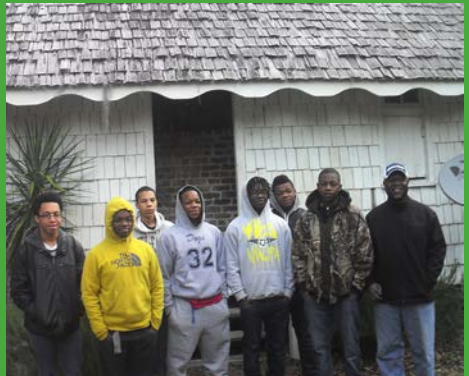
These young men slept in a slave cabin as part of the Slave Dwelling Project, USA, and their experience was part of our 2013 World Heritage Day Blogathon