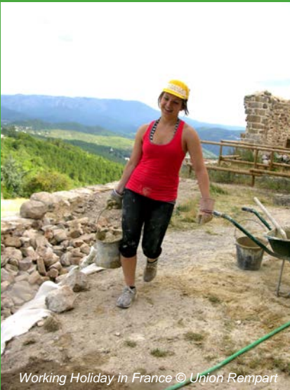
Working Holiday in France

Throughout the year, INTO continued to provide a focal point for the worldwide National Trust movement, advising on the potential for Trusts in the Czech Republic, Portugal and Slovenia, and supporting existing Trust organisations from Jersey to Trinidad; Taiwan to Spain.