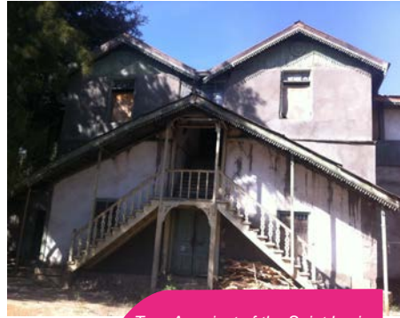
Top: A project of the Saint Lucia National Trust for the Youth Environment Forum